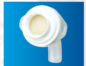
With the CyAdaptor™ and foam filter