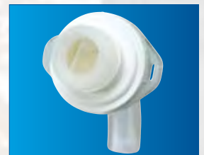
With the CyValveFreedom™ automatic valve